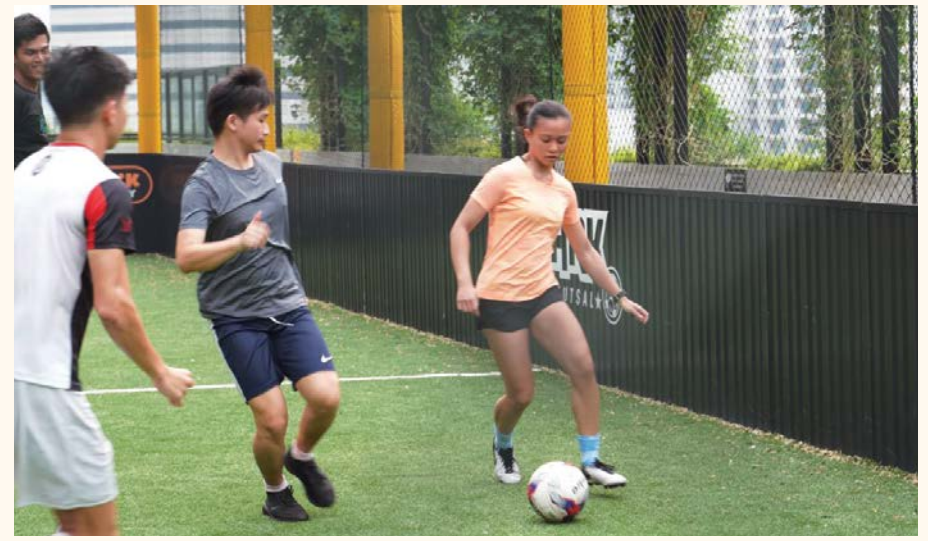
A player exhibits deft footwork as she attempts to dribble the ball away from members of the opposing team.

They split into four teams and played rounds of seven to 10 minutes each, fuelling up on isotonic drinks, bananas and granola bars for that extra boost of energy in between games. "I usually play futsal with friends, so