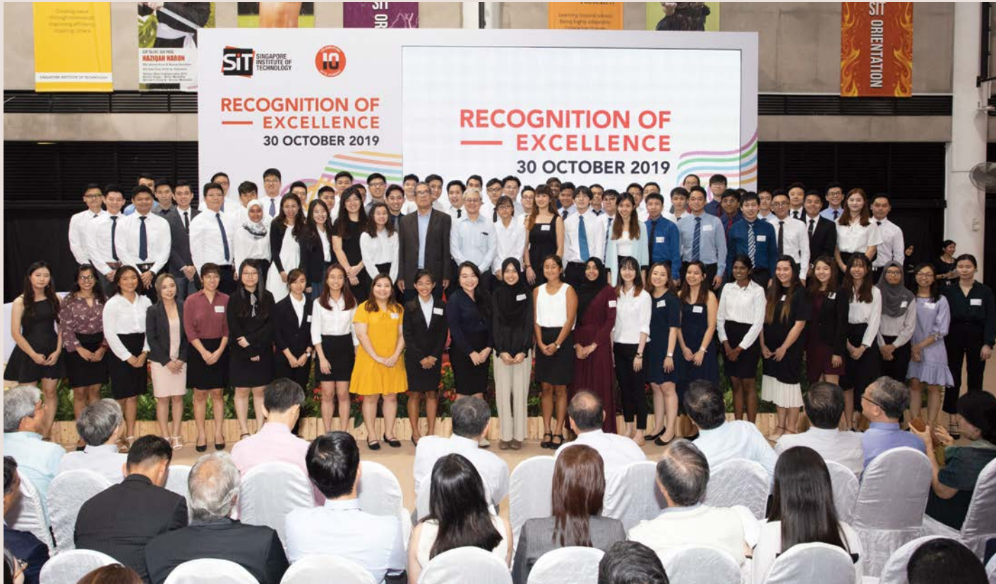
Massive grins from the scholarship recipients for the Academic Year 2019/20.

Now in its fifth year, the Recognition of Excellence continues to be a lively celebration of the impactful support from donors to nurture young talents