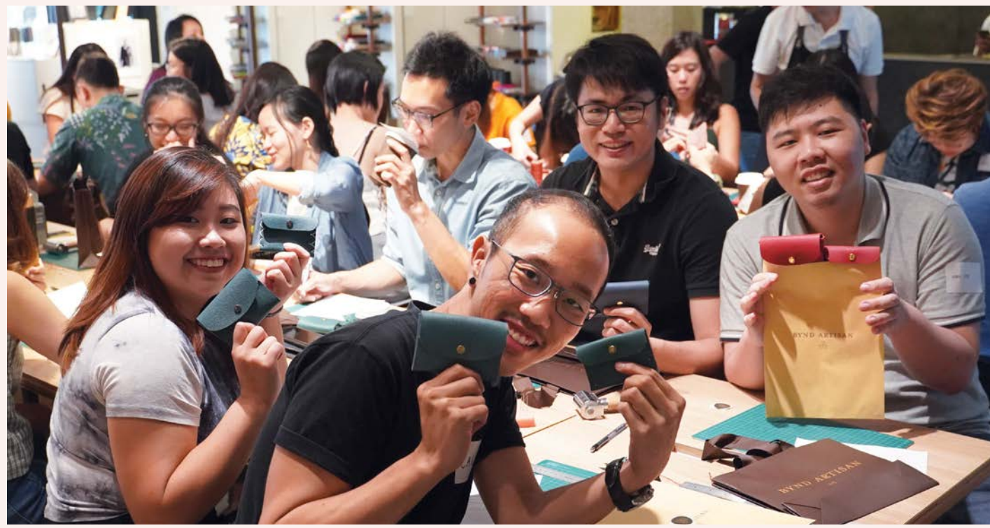
Participants with their completed leather cardholders. They were also provided with bags from Bynd Artisan to take their products home.