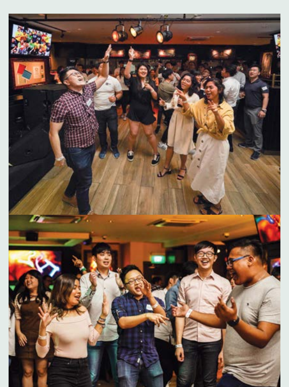
Time to let loose and belt it out to the feel-good hits performed

Engineering programme, said, "The party was really fun and the emcee was very engaging. I was also surprised and delighted that my friends and I managed to win prizes! It was really great that we could all celebrate together."