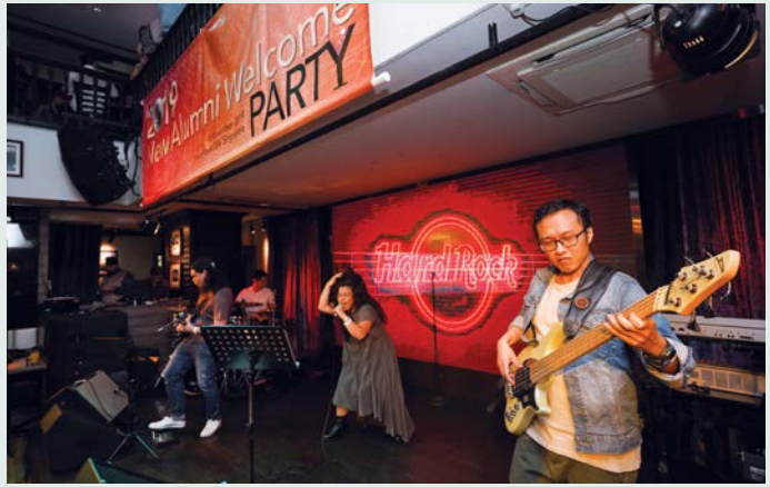
SIT's student band Muzeka rocking out to covers of popular hits