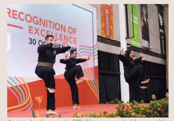
A spirited performance by SIT's Silat group marked the start of the fifth Recognition of Excellence at SIT.