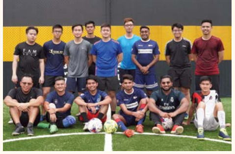
A group photo for keeps after a morning of futsal

More such sports games are in the pipeline, so keep a look out for the upcoming sessions organised by the SIT Alumni Sports Network!