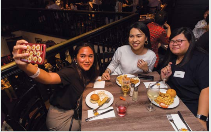
Capturing some great memories.