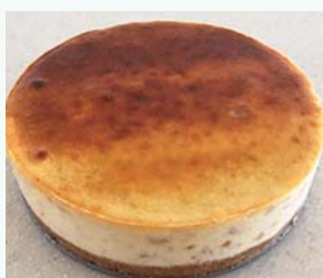
Don't let the plain exterior fool you – underneath lies a rich and tasty cheesecake!