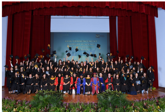
Wheelock College's new graduates are all ready to make a difference in early childhood education.

New cohorts of graduates celebrate their success with eyes firmly on the future and bursting with determination to make their mark in fields ranging from art to early childhood education to engineering.