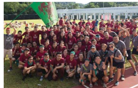
Gryphon won the coveted Winning Empire award.