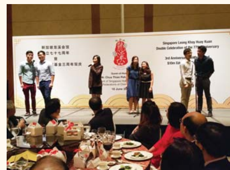
SIT students seized the opportunity to put on a performance at the Singapore Leong Khay Huay Kuan Double Celebration on 18 June 2016.