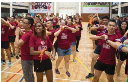
Creating windows of opportunity for friendship at the 2016 SIT Student Orientation.