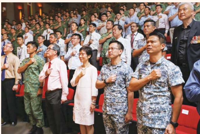
Participants reaffirming their commitment to the defence of the nation at the SAF Day Combined Rededication Ceremony (West Zone) at the Singapore Institute of Technology.

On 1 July, more than 400 guests, including 240 NSmen from 31 participating companies and organisations, joined SIT staff and students for this year's SAF Day Combined Rededication Ceremony (West Zone). The Singapore Institute of Technology (SIT) organised and hosted this year's ceremony, and once again welcomed guests to SIT@Dover, where the 2015 ceremony was co-organised with ST Marine.