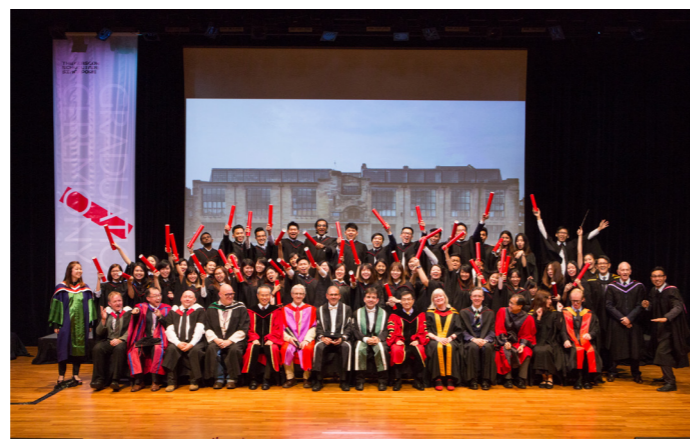
Armed with their degrees, these GSA graduates are ready to prove their worth.