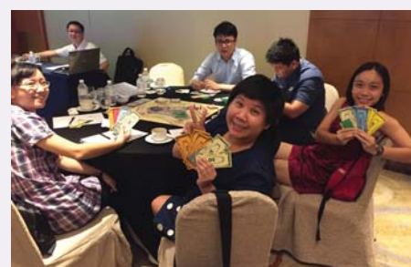
"It might be play money but we're feeling rich!"