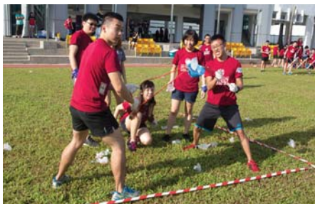
Good teamwork will ensure a good catch every time.