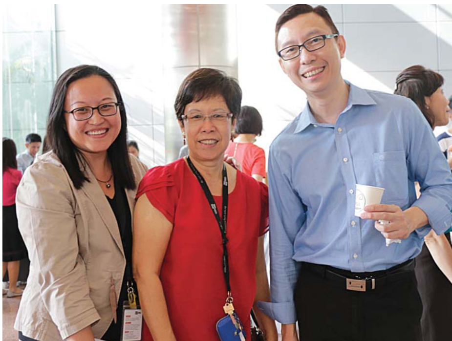
SIT faculty and staff taking time off their busy schedules to support the SIT Bursary.

Faculty and staff gather to support SIT Bursary over a light breakfast shared with bursary recipients