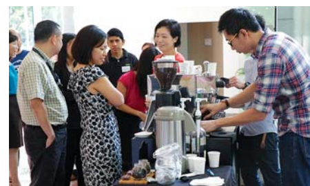
Brewing support for the SIT Bursary programme.