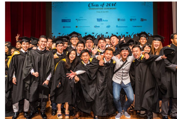
New TUM graduates are determined to excel.

She added, "Due to the fast-paced and intensive block teaching style that we underwent for the past two and a