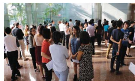
SITizens making full use of the opportunity to mingle.