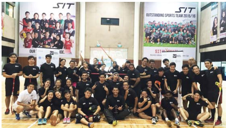
Some of the attendees at the Alumni Floorball Session at the end of the matches.