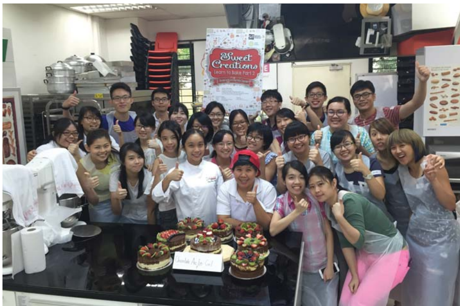
Thumbs up for a job well done and yummy treats to look forward to!