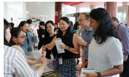
SITizens going for the special otak-otak-youtiao sandwich, which was created just for the SIT Bursary roadshow.