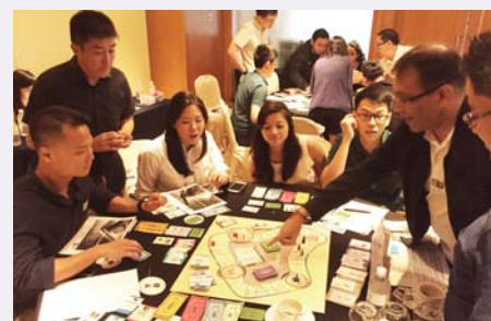
A fun but also painful lesson learnt at the Financial Literacy workshop organised by the SIT Alumni Career Network in July 2016.