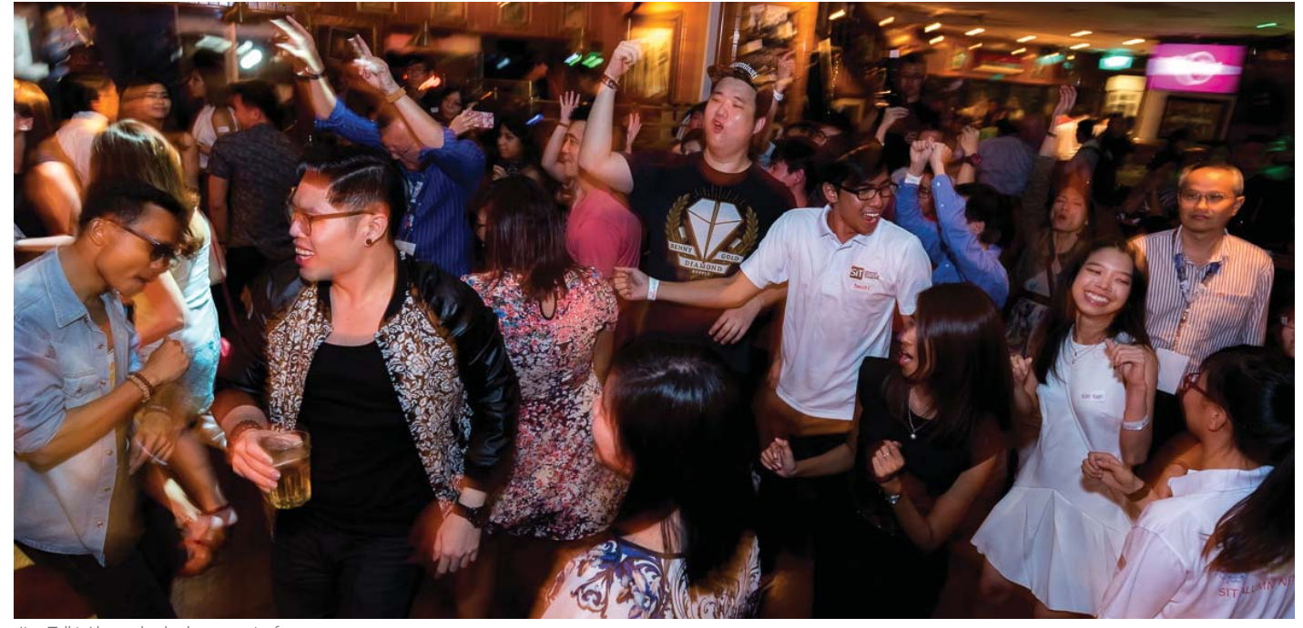
Jive Talkin' brought the house to its feet.