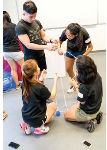
SITizens who learn together also build together.