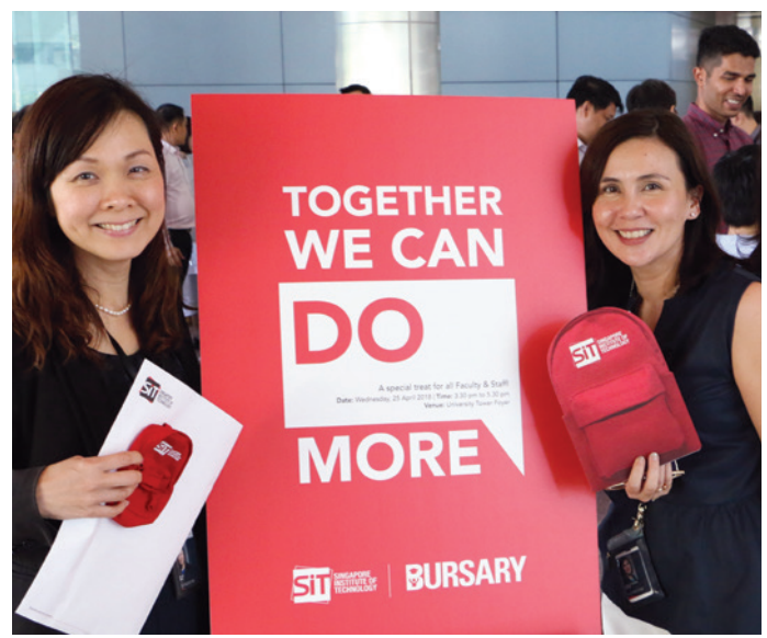
At this year's Faculty & Staff Giving Roadshow, donors received a small token for their big-hearted support of SIT students: a tiny pouch shaped like a mini-backpack.

In appreciation for their support, the fifth Faculty & Staff Giving Roadshow was organised on 25 April 2018 at SIT@ Dover campus. Participants were treated to doughnuts, coffee and freshly fried vadai with green chillies.