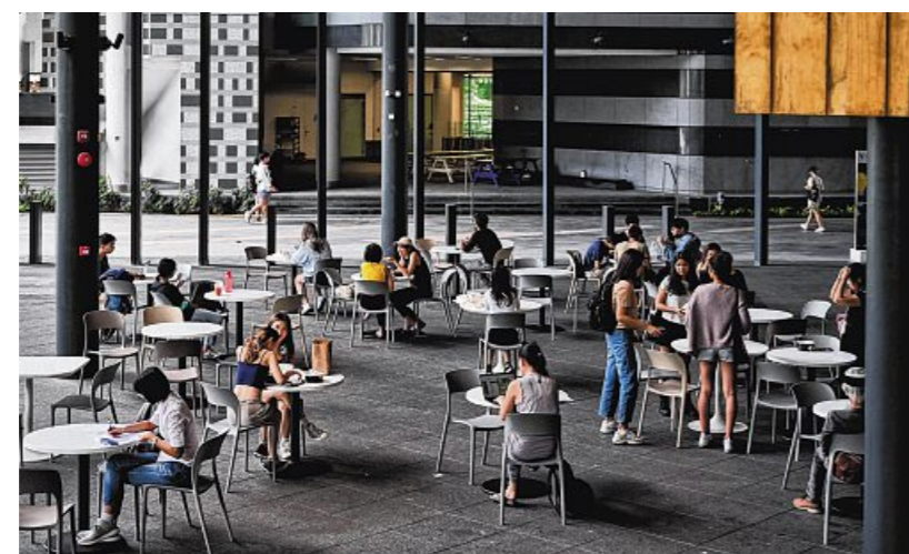
Singapore Management University has a College of Integrative Studies, which gives students the option to individualise their majors with a selection from the university's entire suite of about 1,000 courses.

Source: The Straits Times © SPH Media Limited. Reproduced with permission.