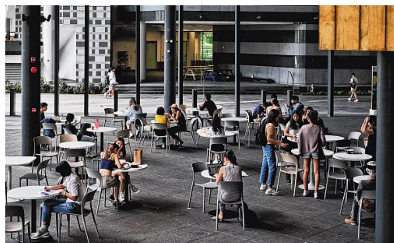
Singapore Management University has a College of Integrative Studies, which gives students the option to individualise their majors with a selection from the university's entire suite of about 1,000 courses.