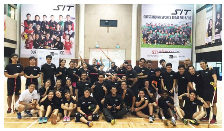
Some of the attendees at the Alumni Floorball Session at the end of the matches.