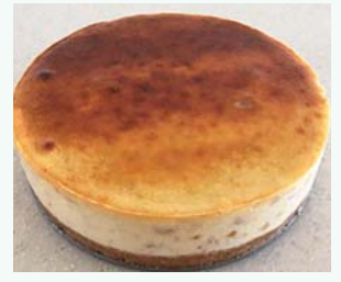
Don't let the plain exterior fool you – underneath lies a rich and tasty cheesecake!