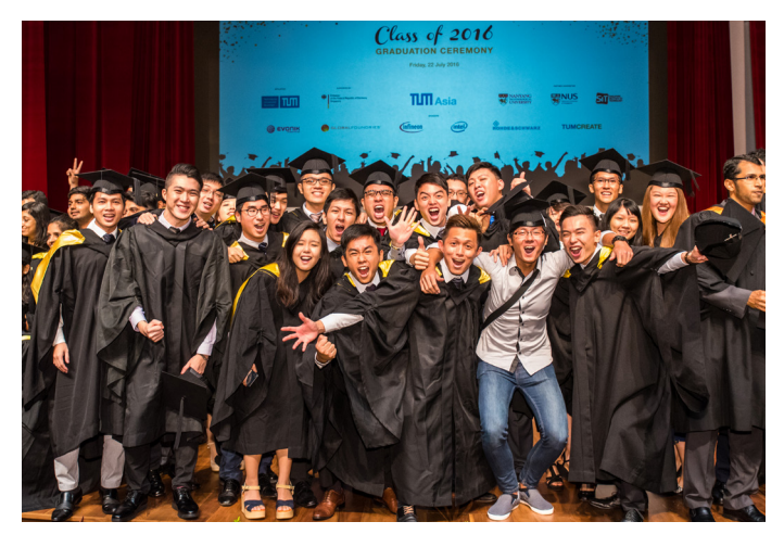
New TUM graduates are determined to excel.

She added, "Due to the fast-paced and intensive block teaching style that we underwent for the past two and a