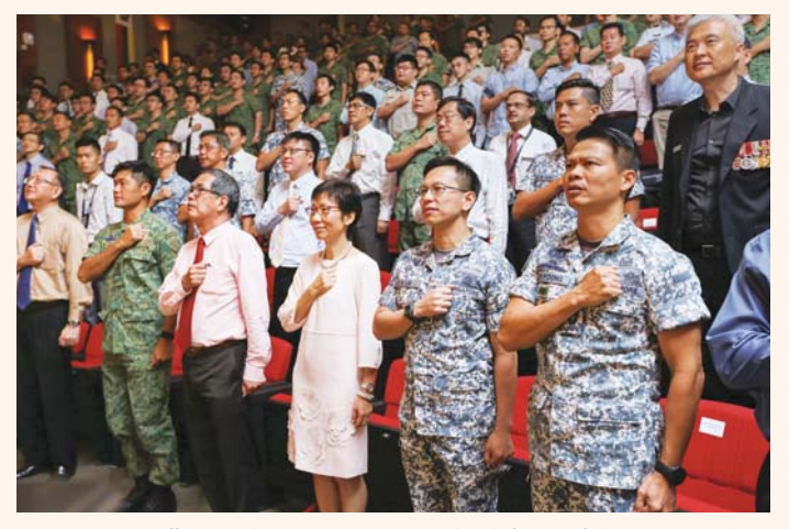
Participants reaffirming their commitment to the defence of the nation at the SAF Day Combined Rededication Ceremony (West Zone) at the Singapore Institute of Technology.

On 1 July, more than 400 guests, including 240 NSmen from 31 participating companies and organisations, joined SIT staff and students for this year's SAF Day Combined Rededication Ceremony (West Zone). The Singapore Institute of Technology (SIT) organised and hosted this year's ceremony, and once again welcomed guests to SIT@ Dover, where the 2015 ceremony was co-organised with ST Marine.